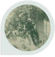
Nature and Ecosystem Services