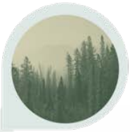
Forest Data Space