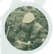
Zero Defect Manufacturing