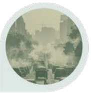
Air Quality and Health