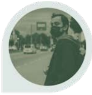
Global Environmental Exposure