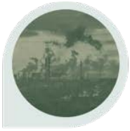
Building Environment CO 2